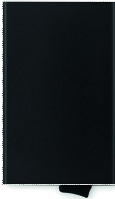
2. FRONT PD