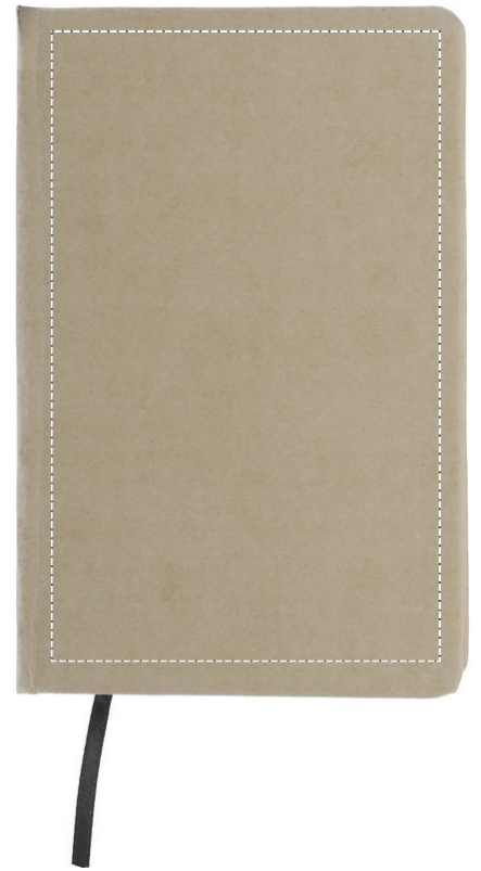
3. FRONT PD