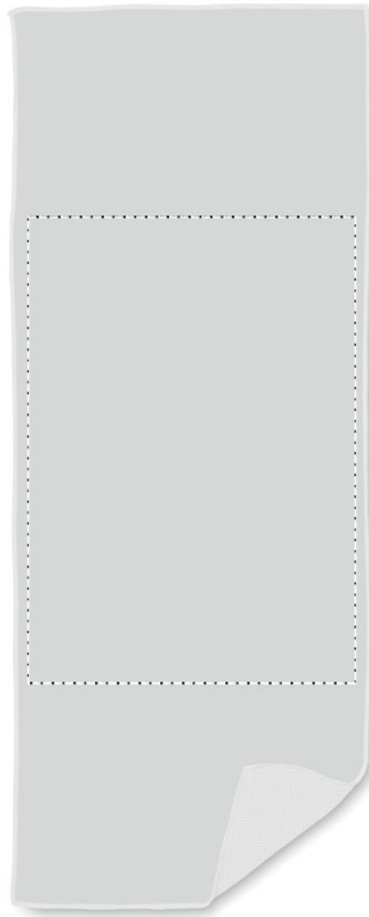
1. TOWEL FRONT TEXTURED