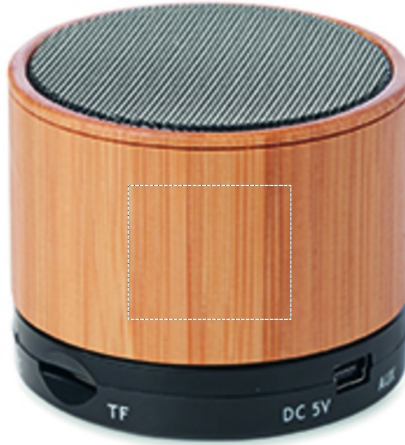
2. SIDE 2