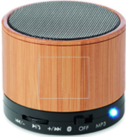
1. SIDE 1