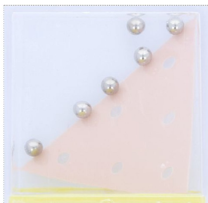
4. BACK PD