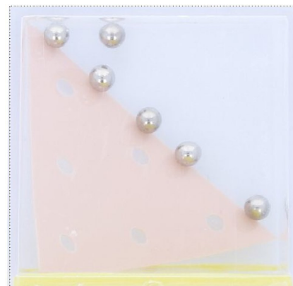
3. FRONT PD