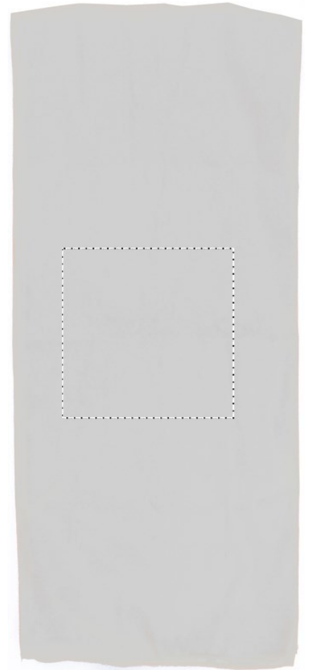
3. TOWEL BACK