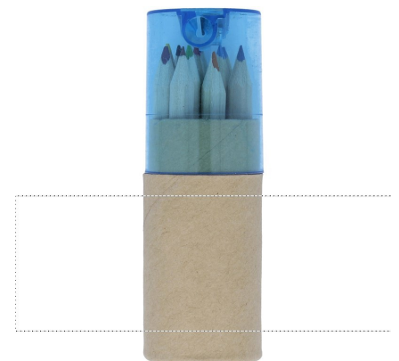
3. CARTON DL