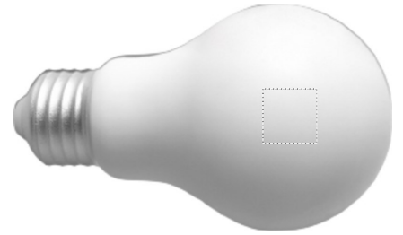
3. FRONT TRANSFER