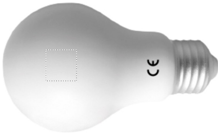
4. BACK TRANSFER