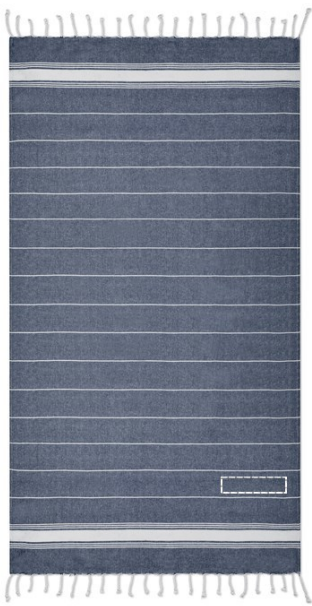
1. TOWEL CORNER